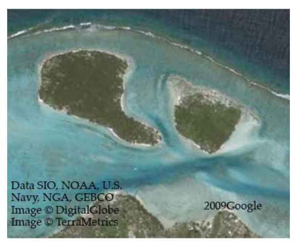
FIG. 2 Satellite image of Motu Fareone to the west and Tiahura to th east, Google Earth Pro. 2009

Motu Tiahura is to the east of Motu Fareone and is the smaller of the two islets, situated offshore at Haru Point (fig 2).