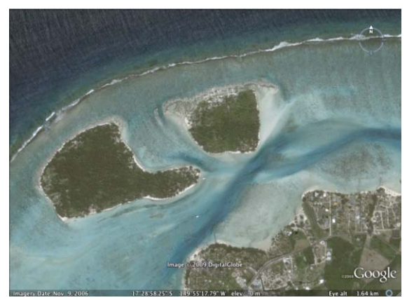
FIG. 6. Google Earth Pro. 2009 satellite images of Motu Tiahura to the east and Motu Fareone to the west. There has been some change in shape to the SW corner of Motu Tiahura and the sand bar distribution to the east. Most notable is the amount of development on Mo'orea proper (bottom right corner).