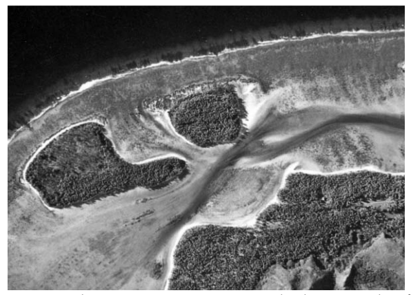
FIG. 5. The 1955 U.S. Navy aerial photograph of Motu Tiahura to the east and Motu Fareone to the west.

Comparing the 1955 image of Motu Tiahura ( fig. 5 ) the Google Earth Pro. 2009 ( fig. 6 ) show that some erosion has taken place in the past 50 years. The general shape appears to be similar, although the sand bar build-up on the east side does not seem to extend as far onto the reef flat.