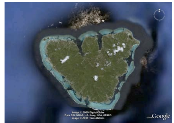
FIG. 1. Satellite Image of Mo'orea, French Polynesia from Google Earth Pro 2009. Circled in the NW corner are Motu Tiahura and Motu Fareone Google Earth Pro. 2009 Data SIO, NOAA, U.S. Navy, NGA, GEBCO

Motu Tiahura is located on the northwestern tip of the island of Mo'orea, French Polynesia, in the Society Islands archipelago, GPS point 17°29'12.66", 149°54'43.82" (fig. 1).