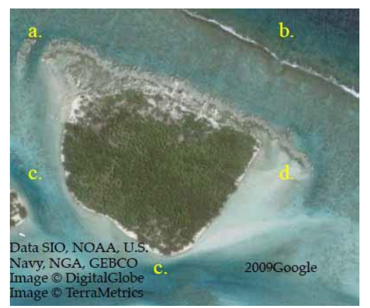
FIG. 3. Satellite image of Motu Tiahura. Google Earth Pro. 2009. (a) Shows conglomerate platform, (b) barrier reef and ocean to the north, (c) the 2 channels along the western and southern facing sides, and (d) the sand deposits on the eastern facing side.

Each side of Motu Tiahura is geologically distinct. The northern ocean side faces the barrier reef, where a conglomerate platform has formed as a result of coral detritus and sediment that has accumulated and cemented together. The eastern side has large areas of unconsolidated sand deposits while the western facing side has a channel that runs between the two motu. The southern facing point along with the adjacent side has a mixture of both erosional and depositional properties; at this point a boat channel runs between the motu and the main island of Mo'orea.